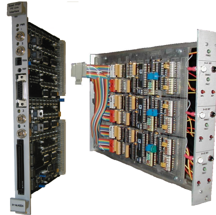
Figure 3 The PCLIM module (left) interfaces the FPDP output stream with the legacy PCLink interface that was inherited from TFTR while the SPAIM (right) interfaces FPDP to a switching power amplifier with analog inputs.

Power supply commands are output through the second FPDP i/o card to a module, shown in Figure 3, which was developed at PPPL and is known as a PCLIM (PC-Link Interface Module). This module converts data into the digital format of the PCLink (Power Conversion Link), described in reference [iv], which was developed for use on TFTR (Tokamak Fusion Test Reactor) in the early 1980's. Each 32 bit FPDP data word written from the output computer consists of both data and routing information, with 16bits of routing information and 16 bits of power supply command data. The digital commands are converted to rectifier pulses in firing generators inside the individual rectifier supplies after the routing information is stripped out.