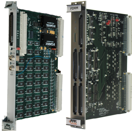
Figure 2 Shown on the left, the Stand Alone Digitizer (SAD) developed at PPPL, is a simple 32 channel FPDP digitizer. Shown on the right is the Front Panel Data Port Input Multiplexing Module (FIMM) developed at PPPL combines multiple FPDP streams.

Data for the gas system is still taken via the VME bus using VME based digitizers. The acquisition latency for this system is higher, and it is planned to replace the VME system with FPDP based i/o in the near future.